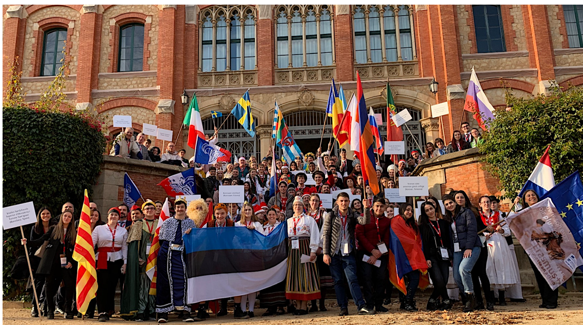
Group picture in front of Jesuites Sarrià Sant Ignasi Hotel and Tourism Management School

The three pillars of Christmas in Europe were as usual: the exhibition of the culinary traditions and other aspects of the countries present; the European buffet as well as a parade in costumes and a cultural show, all based on each delegation's respective traditions.